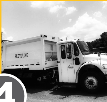
Reduce. Reuse. Recycle.