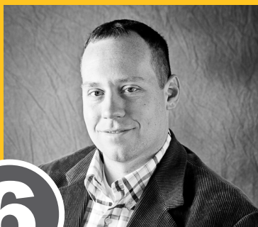
From the Administrator's Desk