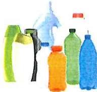
#2 HDPE Jugs & Bottles