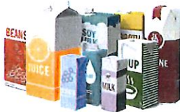
Food and Beverage Cartons