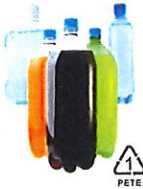
#1 PET Drink Bottles