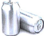
Aluminum Cans - Must be clean and empty -