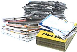
Mixed Paper: Mail, Magazines, Phone Books & Newspaper