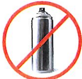
Aerosol Spray Cans