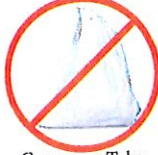
Grocery or Take-out Plastic Bags